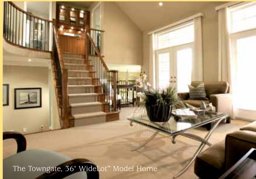
The Towngate, 36' WideLot™ Model Home

A well designed family home will make you feel immediately comfortable. The interior spaces should feel open and accommodate your family's traffic patterns and lifestyle. Mattamy WideLot™ homes boast a high level of finishing detail and top-notch workmanship. There is a place for everything which helps create a stress-free zone for family living. New urban lifestyles have greatly effected the way people interact with their homes and we have designed many of our homes with abundant family features like kitchen islands, niches to keep things neatly in their place and many models with window seats to appeal to modern living. We also feature larger windows so cheerful, natural light floods the home. Warm, inviting and functional are the design principles we follow to create homes that are worthy of being the centre of family life.