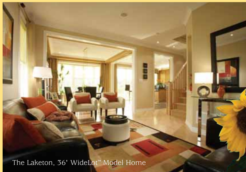
The Laketon, 36' WideLot™ Model Home

"In fact, the price was great, and because we were so content with the location, we bought a slightly larger home than we originally planned. Compared to Toronto, we feel we got more bang for our buck, especially given the luxury features that were included as standards in the home"