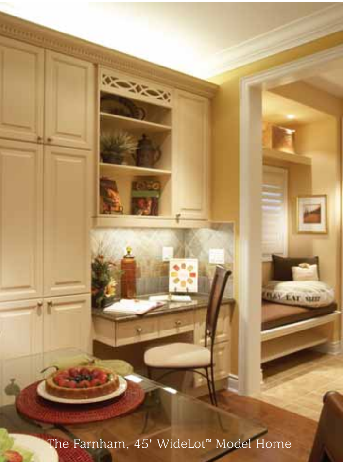
The Farnham, 45' WideLot™ Model Home

"We wanted a home with plenty of elbow room because we love to entertain. Our Mattamy home has a huge kitchen that opens directly to the Great Room which will be great for family gatherings & parties."