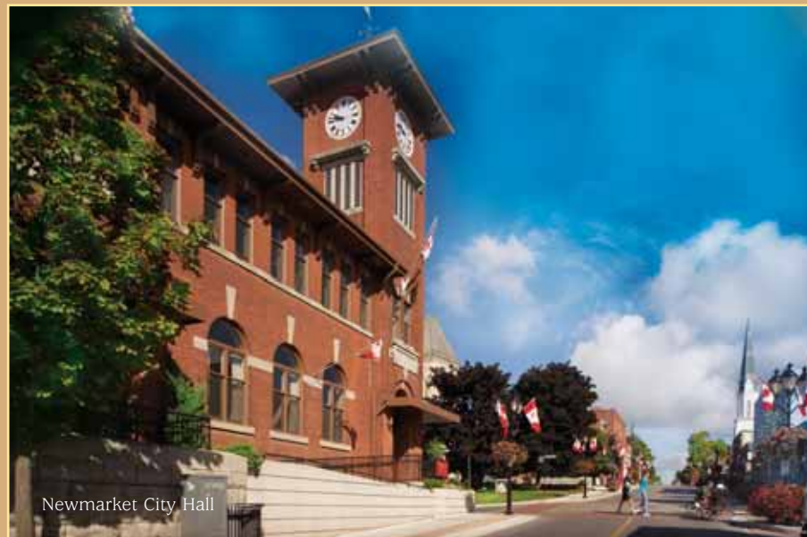
Newmarket City Hall