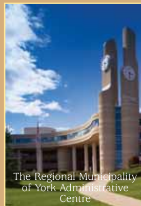
The Regional Municipality of York Administrative Centre